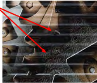
Tenting over rivets even on relatively flat surfaces.