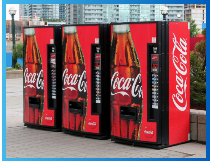
TransferRite 6882 works the best for screen printed graphics, adhering to UV inks that pose challenges for other tapes in the market.

PM-12 PalletMask high tack | standard paper Protective masking for screen printing pallets Use ensures a fresh, smooth surface for every print run Removes cleanly and easily Eliminates the need for cleaning solvents