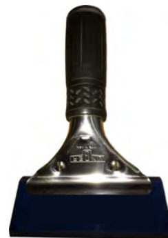
Standard Squeegee (for 3M™ FASARA™)